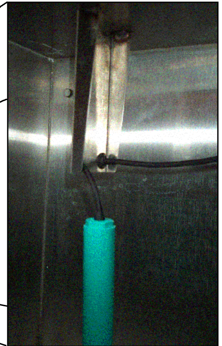
Mercury-free Level Switch 12 VDC